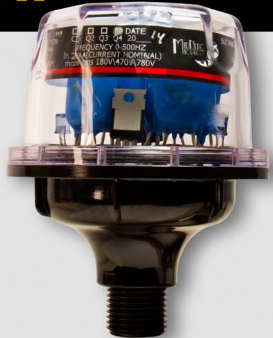
MNSPD300ACFM (Cut-in box) (MNSPD-300-AC included)

17722 67th Ave. NE., Arlington, WA. 360-403-7207 FAX: 360-691-6862